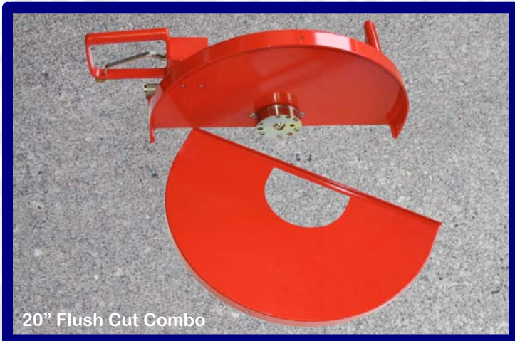
20" Flush Cut Combo